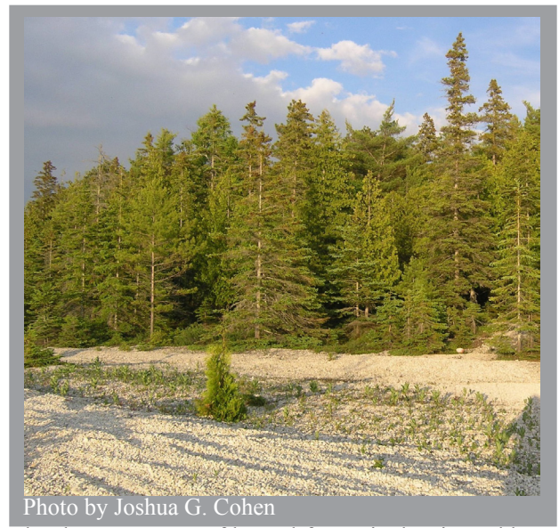
The dense canopy of boreal forest is dominated by spire-shaped conifers (i.e., cedar, white spruce, and balsam fir.

rodent densities and granivory rates are likely inversely proportional to fire severity with rodent populations plummeting following intense fires (Charron and Greene 2002, Greene et al. 2004). As noted above, initial pulses of conifer recruitment are likely influenced by rodent population crashes following wildfires (Greene et al. 2004).