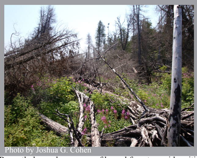
Recently burned expanses of boreal forest provide critical but rare and ephemeral habitat for unique species such as the black-backed woodpecker.

harvesting following fire, wind, and insect disturbance. Salvage logging, especially after wildfire, can severely diminish nutrient pools and site productivity in addition to reducing structural heterogeneity (Brais et al. 2000, Morissette et al. 2002, Nappi et al. 2004). As noted above, recently burned areas, which provide critical habitat for a host of species, are rare within firesuppressed and managed landscapes (Schmiegelow and Monkkonen 2002, Bergeron et al. 2004a).