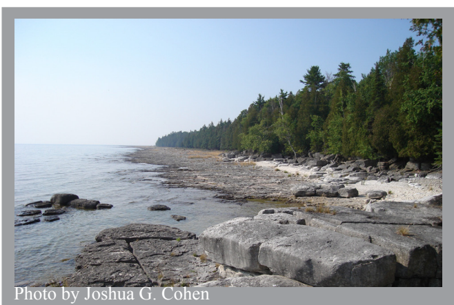
Systematic surveys of both coastal and inland boreal forest are needed to improve the classification of these systems and to allow for the prioritization of conservation and management efforts.

Research Needs: Boreal forest has a broad distribution and exhibits subtle regional, physiographic, and edaphic variants. The lack of a universally accepted classification system of boreal forest and the diversity of variations throughout its range demands the continual refinement of regional classifications that focus on the inter-relationships between vegetation, physiography, microclimate, and disturbance (Barnes et al. 1982). Systematic surveys for boreal forests are needed to help prioritize conservation and management efforts. Classification and survey efforts should incorporate nonvascular species, an often understudied group in boreal systems (Desponts et al. 2004).