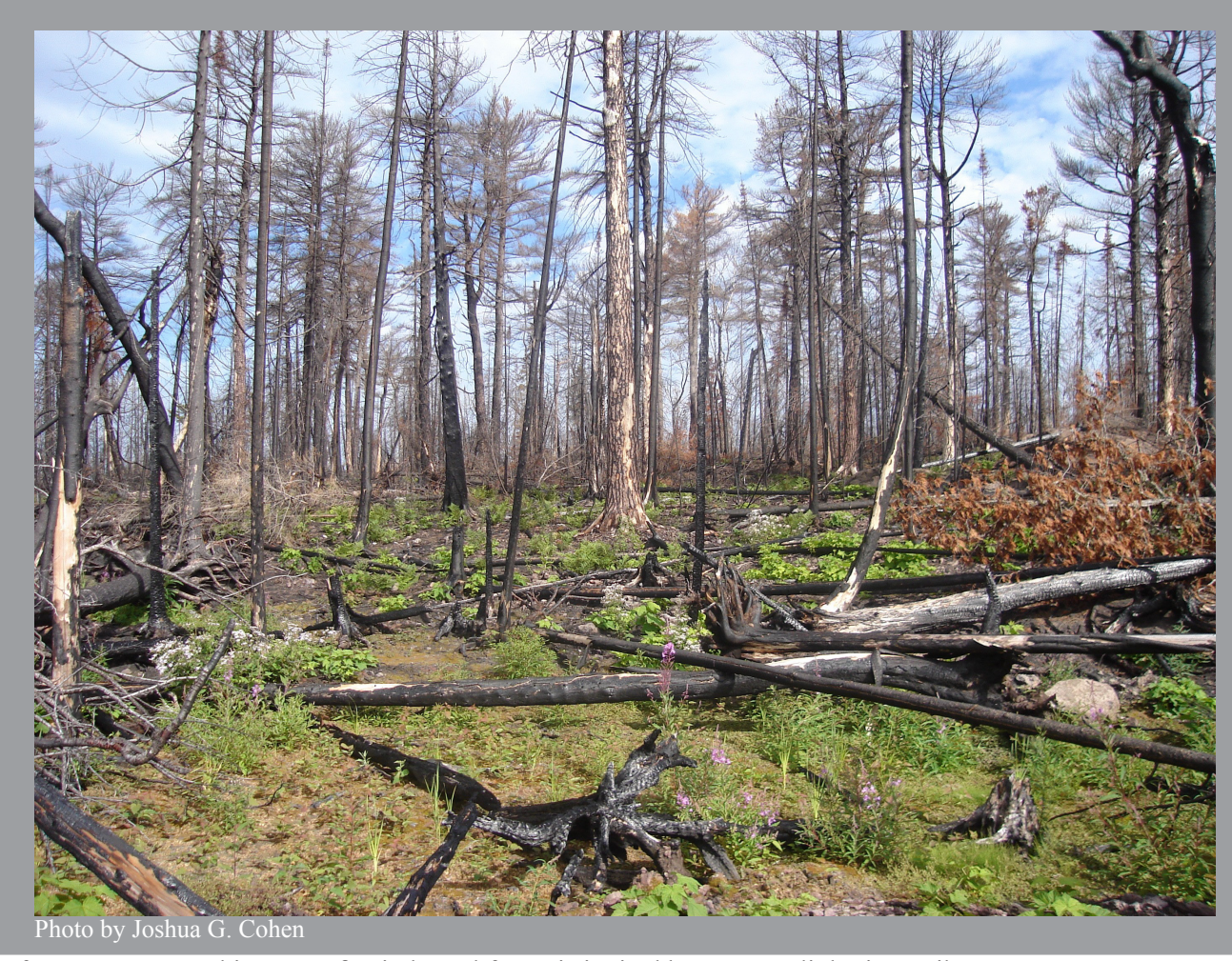
Infrequent catastrophic crown fire in boreal forest is ignited by summer lightning strike.

fires within boreal forests is summer lightning strikes that occur during persistent high-pressure systems (Cooper 1913, Rowe and Scotter 1973, Bergeron 1991, Johnson 1992, Heinsleman 1996, Johnson et al. 2001, Bergeron et al. 2004b); however, historically, fires were likely also started by Native Americans (Cooper 1913, Heinselman 1996, Loope and Anderton 1998). Probability of ignition from lightning strike is amplified by increasing conifer coverage in the canopy, stand age, and drought conditions (Cumming 2000, Krawchuck et al. 2006).