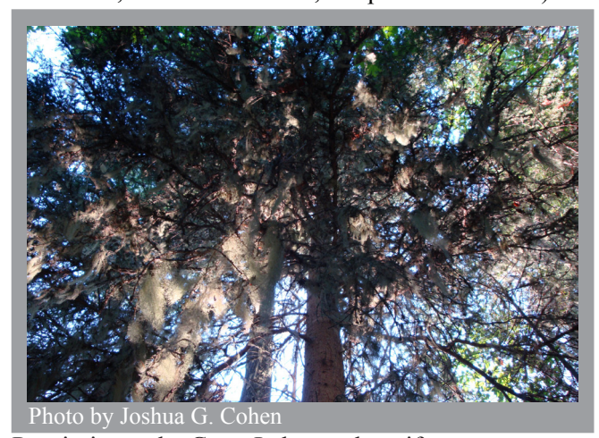
Proximity to the Great Lakes and coniferous canopy coverage generate moisture conditions suitable for a diverse array of non-vascular flora such as Usnea lichens.

Clubmosses, such as Lycopodium annotinum (stiff clubmoss), L. clavatum (running ground pine), and L. obscurum (ground pine), are often locally abundant (Cooper 1913, Grant 1934, Buell and Niering 1957, Maycock 1961, Maycock 1965, La Roi 1967, Grigal and Ohmann 1975, Ruttowski and Stottlemyer 1993), with ground pine more common following fire (Reich et al. 2001). Mosses, liverworts, Usnea lichens, and saprophytic fungi often are common due to favorable, moisture conditions (Cooper 1913, Curtis 1959, Stearns et al. 1982, Heinselman 1996, Desponts et al. 2004).