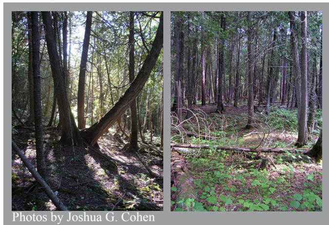
Dense tree coverage results in low levels of light transmission to the sparsely vegetated understory and ground cover of boreal forests.