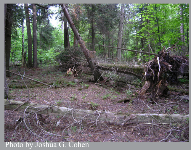
Boreal forest with numerous windthrow gaps occurring on thin soils over limestone cobble on Bois Blanc Island.

Cohen, J.G. 2007. Natural community abstract for boreal forest. Michigan Natural Features Inventory, Lansing, MI. 24 pp.