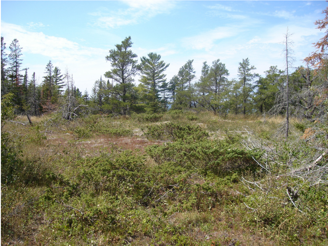
Volcanic bedrock glade is an open forested or savanna community found where basaltic bedrock and conglomerates are exposed. The sparse vegetation consists of scattered open-grown trees, scattered shrubs and shrub thickets, and a partial turf of herbs, grasses, sedges, mosses, and lichens.