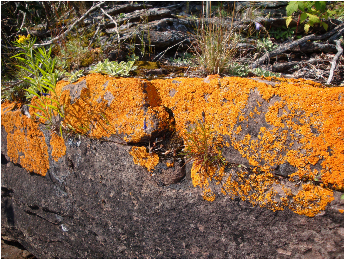
Non-vascular flora, lichens, mosses, and liverworts, are often common along the exposed cliff face while vascular plants are typically sparse and restricted to crevices and ledges.