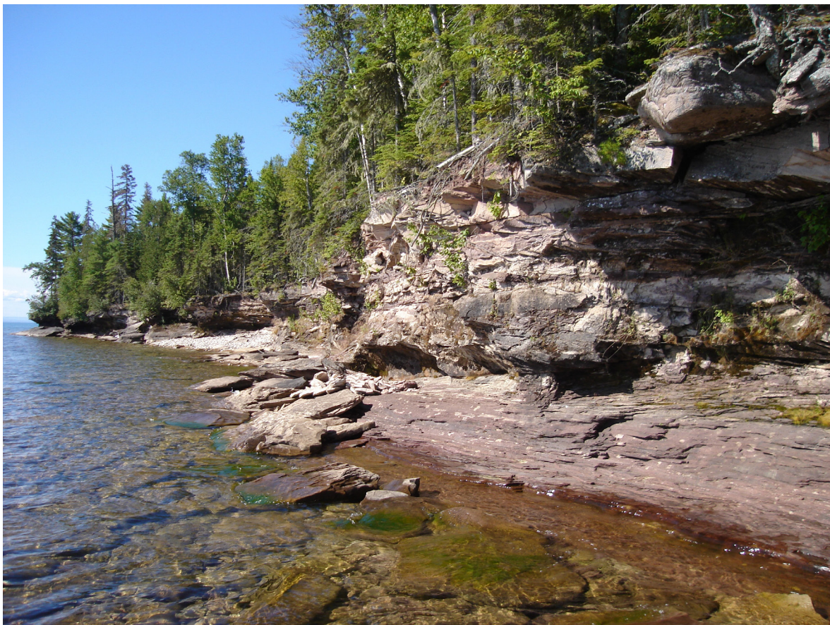
Sandstone lakeshore cliff, Houghton County, Michigan.

Funding for abstract provided by Michigan Department of Transportation.