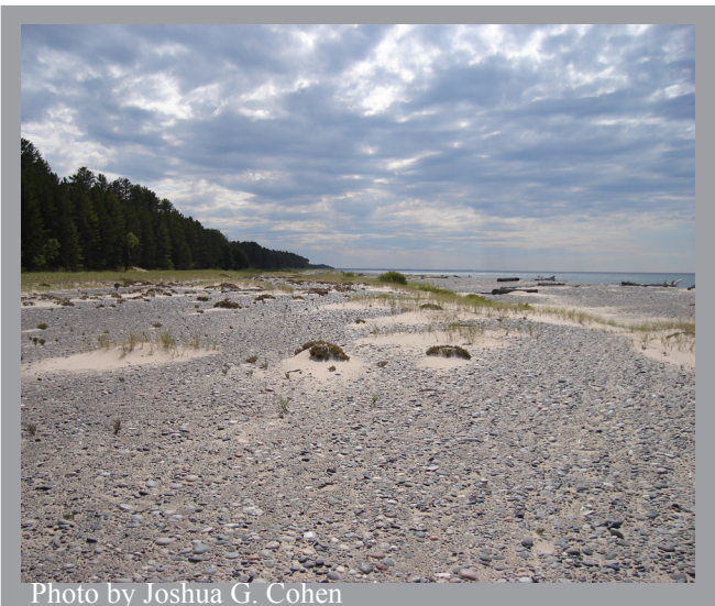
Sand and gravel beach along the Lake Superior shoreline. Luce County (above) and Ontonogan County (below).