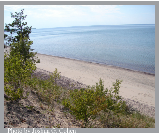
Sand and gravel beach frequently occurs lakeward of open dune systems.

origin are common throughout Canada, the Great Lakes region, and northeastern states on a variety of glacial landforms. Natural communities occurring adjacent to sand and gravel beach include open dunes, wooded dune and swale complexes, interdunal wetlands, bedrock lakeshores, lakeshore cliffs, and cobble shores.