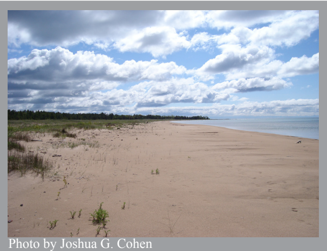
Vegetation on sand and gravel beach is sparse due to wave, wind, and ice action as well as desiccation and burial by sand.

values on gravel beaches are typically even lower than on sand beaches, as the energy levels that create gravel beaches are generally higher than those of sand beaches, and moisture availability is reduced by the large particle size of the substrate. Shrubs such as Salix spp. (willows), Alnus rugosa (speckled alder), Physocarpus opulifolius (ninebark), and Rosa acicularis (wild rose) are most characteristic of gravel beaches, and these are concentrated along the upland margin of the beach. Lathyrus japonicus (beach pea) was the most common herbaceous plant growing on the gravel beaches of Lake Superior in Minnesota (Minnesota Department of Natural Resources Ecological Land Classification Program 2003).