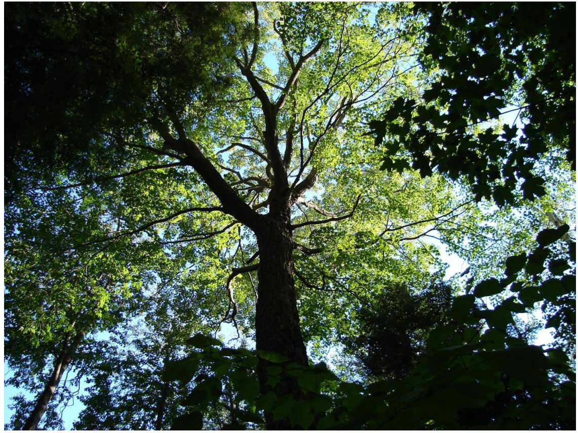
The dense, shade-tolerant canopy of mesic northern forest is periodically and patchily opened by small-scale windthrow events that generate canopy gaps critical for tree regeneration.