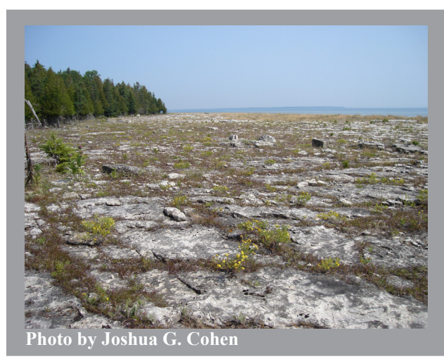
The sparse vegetation is restricted to cracks and fissures in the limestone bedrock.

Calamintha arkansana, Potentilla anserina, Juncus balticus, Deschampsia cespitosa, Panicum lindheimeri