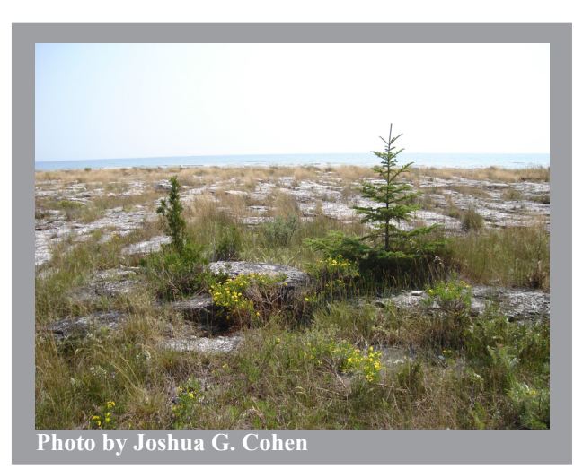
Limestone bedrock lakeshore, Delta County, Michigan.