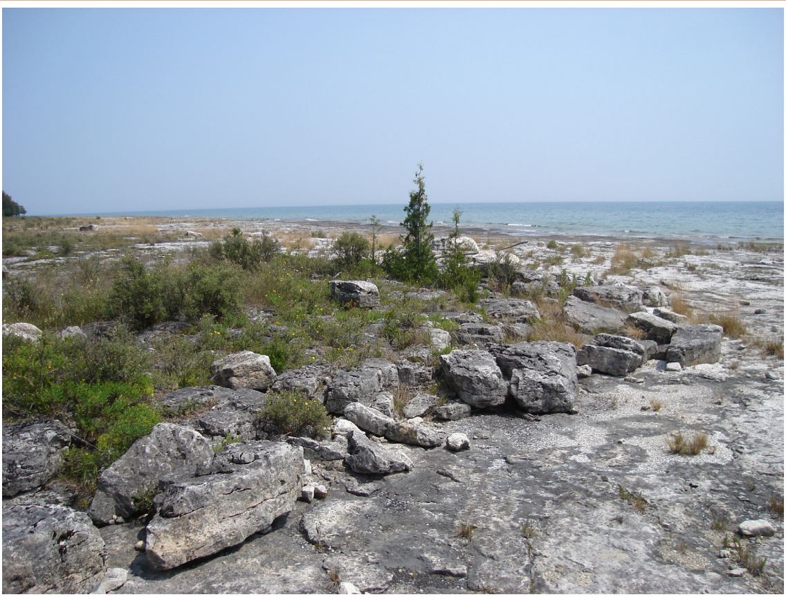
Limestone bedrock lakeshore occurs along the shorelines of northern Lake Michigan and Lake Huron on broad, flat, horizontally bedded expanses of limestone or dolomite bedrock that support sparse vegetation concentrated in cracks and depressions in the bedrock.