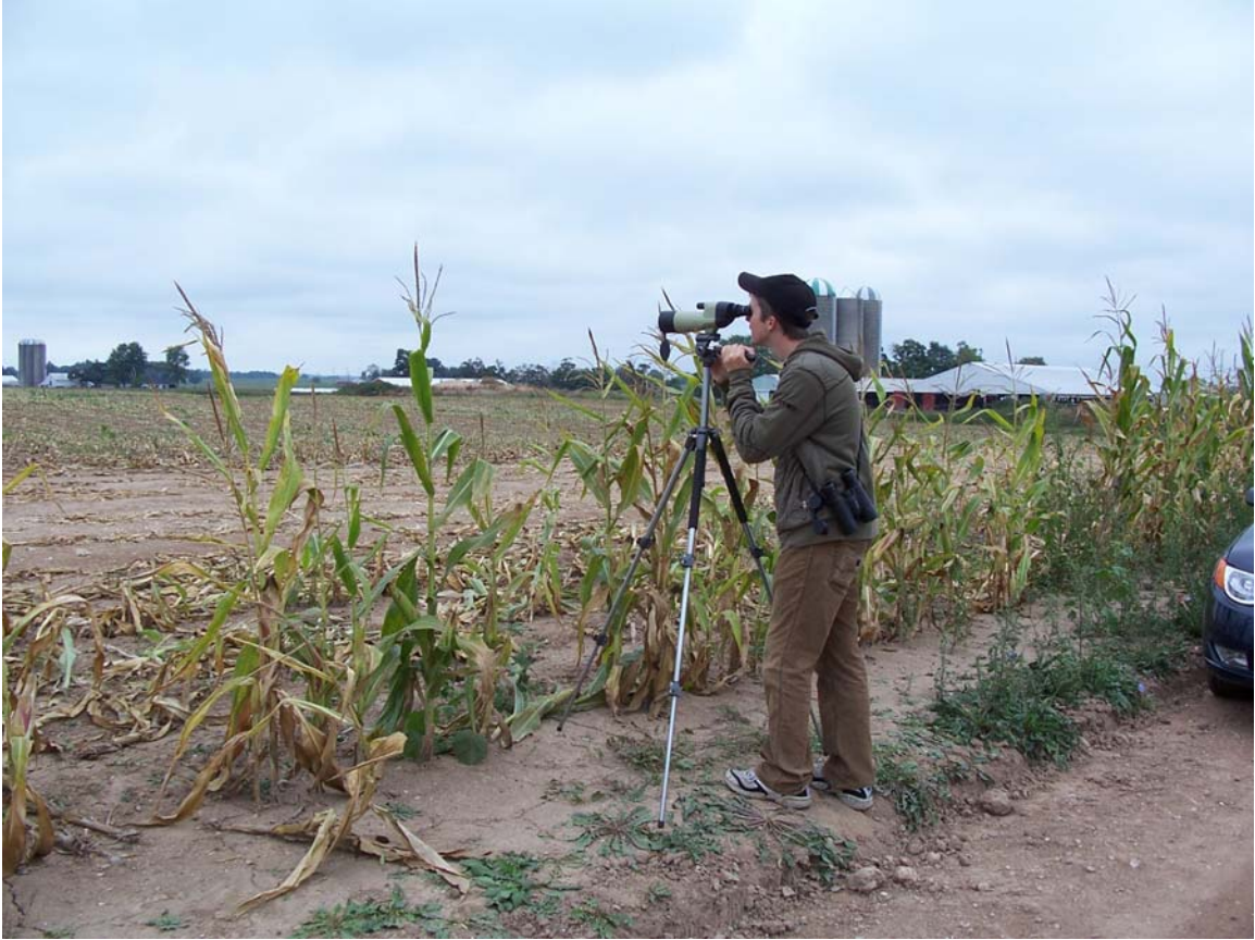
Figure 2. In the winter of 2012 observers surveyed the viewshed for Short-eared Owls from the viewing stations in the Cross Winds Project Area.