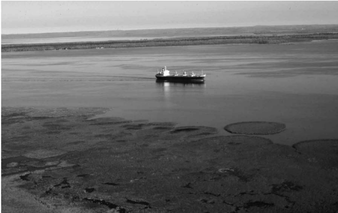
FIG. 7. Riverine hydrologic system: Connecting channel (RC--), St. Marys River (MI, ON).

Channel, open drowned river-mouth (RCRO)), barred drowned river-mouth ( Connecting Channel, barred drowned river-mouth (RCRB)), ( Connecting Channel, barrier beach lagoon (RCBL)), ( Connecting Channel, swale complexes (RCBS)), and deltaic wetlands ( Connecting Channel, delta (RCD--)). Other subtypes were also represented along the connecting channels, but with lesser coverage.