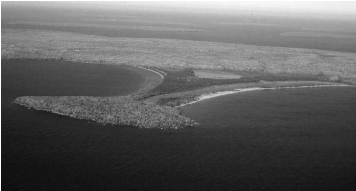
FIG. 10. Barrier-enclosed hydrologic system: Tombolo (BLT-), Stockton Island (WI), Lake Superior.

and Bark Bay, Siskiwit Bay, and Allouez Bay (WI) in Lake Superior. Great Marsh (IN, IL) at the southern tip of Lake Michigan formed in a similar setting. In addition to barrier beach lagoons, tombolo (BLT-) are present in selected areas of the Great Lakes (Fig. 10). These are defined as islands attached to the mainland by barrier beaches, some of which consist of one or two lagoons with deep organic soils. Small swale complexes are sometimes included within a tombolo. Small barrier beach lagoons often are completely dominated by vegetation, with no open water remaining. Such completely vegetated barrier beach lagoons are classified as Successional Barrier Beach Lagoons (BLS-).