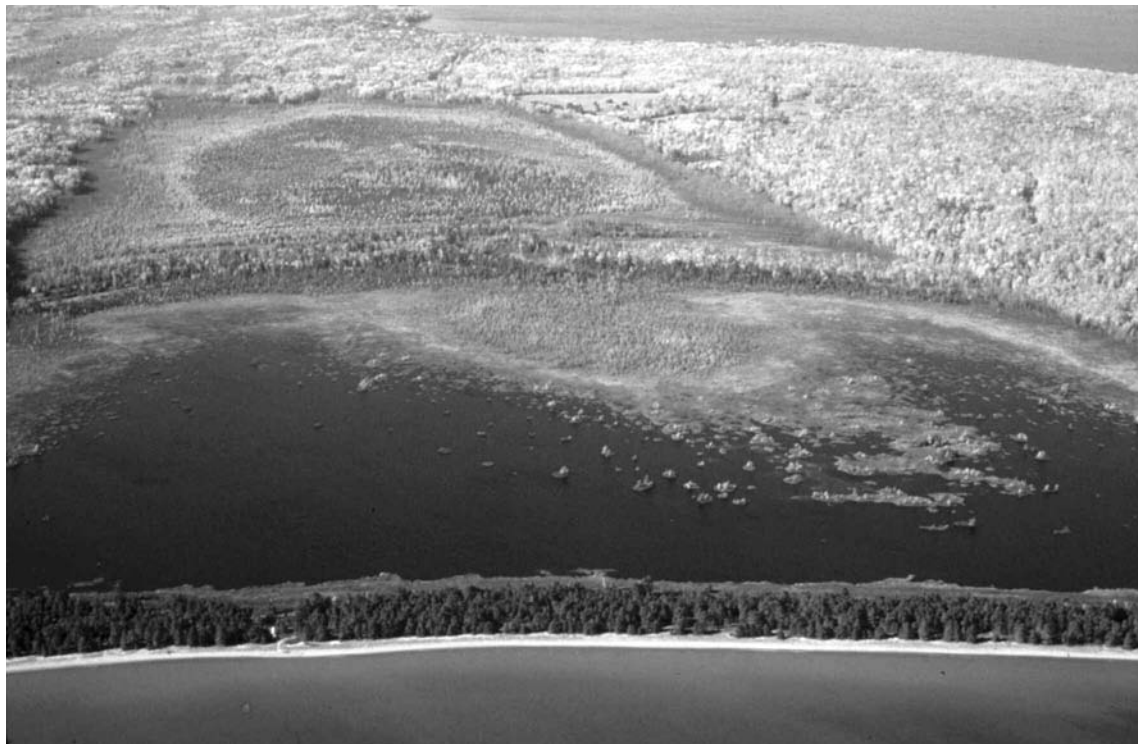
FIG. 9. Barrier-enclosed hydrologic system: Barrier beach lagoon (BL--), Big Bay (WI), Lake Superior.