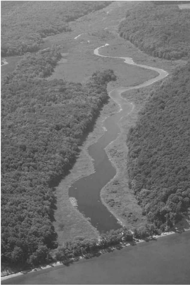
FIG. 6. Riverine hydrologic system: Barred drowned river-mouth (RRB-), Beaver Creek (ON), Lake Ontario.

small lake present where they meet the shore (Fig. 5). The wetlands along these streams occur along the river banks, and their plant communities are growing on deep organic soils. Examples include the West Twin River on the Wisconsin shore of Lake Michigan, the Kakagon River on the Wisconsin shore of Lake Superior, and the Greater Cataraqui River on the Ontario shore of Lake Ontario.