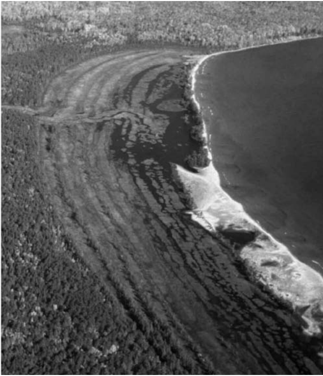
FIG. 11. Barrier-enclosed hydrologic system: Ridge and swale complex (BSR-), Stockton Island (WI), Lake Superior.

supply that the embayment receives and the relative importance of drainages. The former can enhance groundwater discharge into the system, whereas the latter is instrumental in removing groundwater and surface water. Other examples of this wetland type include the Ipperwash Interdunal Wetlands Complex along southern Lake Huron (ON), the Grand Traverse embayment on the Keweenaw Peninsula (MI) in Lake Superior, and the adjacent Manistique and Thompson embayments (MI) in northern Lake Michigan.