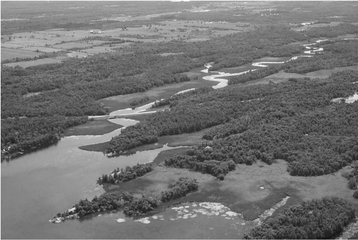
FIG. 5. Riverine hydrologic system: Open drowned river-mouth (RRO-), Crooked Creek (NY), St. Lawrence River.

Matchedash Bay (ON) in Lake Huron, and Bayfield Bay (ON) on Wolfe Island in Lake Ontario. A type of protected embayment encountered along localized stretches of the Great Lakes shoreline is the solution embayment (LPPS). These roughly circular indentations in the bedrock are formed by solution processes in carbonate rock. These indentations are occasionally open to the Great Lakes, forming a protected embayment. The latter wetland type occurs along the shoreline of northern Lakes Michigan, Huron, and Ontario. One example is El Cajon Bay (MI) in northern Lake Huron.