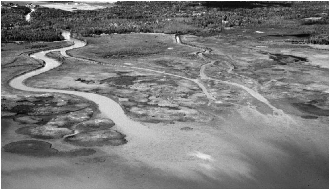
FIG. 8. Riverine hydrologic system: Delta (RD--), Munuscong River (MI). Because the Munuscong River is a tributary of the St. Marys River, a connecting channel between Lake Superior and Lake Huron, the Munuscong River delta would be coded RCRD.