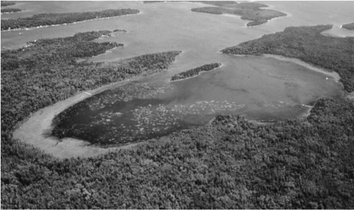
FIG. 3. Lacustrine hydrologic system: Protected embayment (LPP-), Duck Bay (MI), northern Lake Huron.