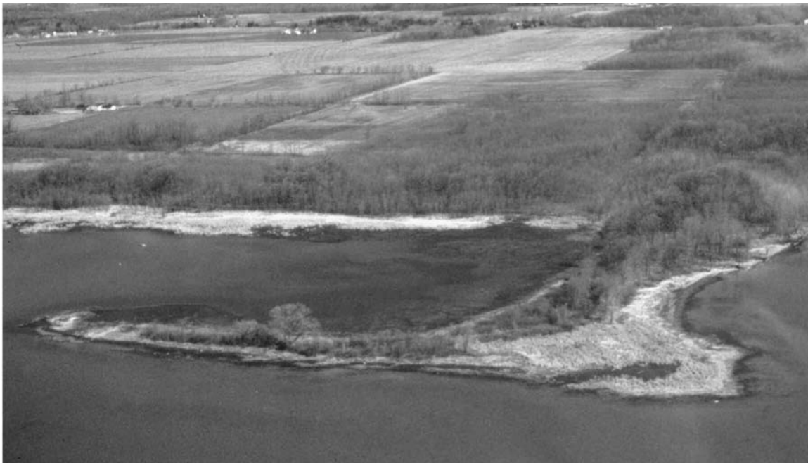
FIG. 4. Lacustrine hydrologic system: Sand-spit embayment (LPS-), Pinconning Bay (MI) within Saginaw Bay, Lake Huron.