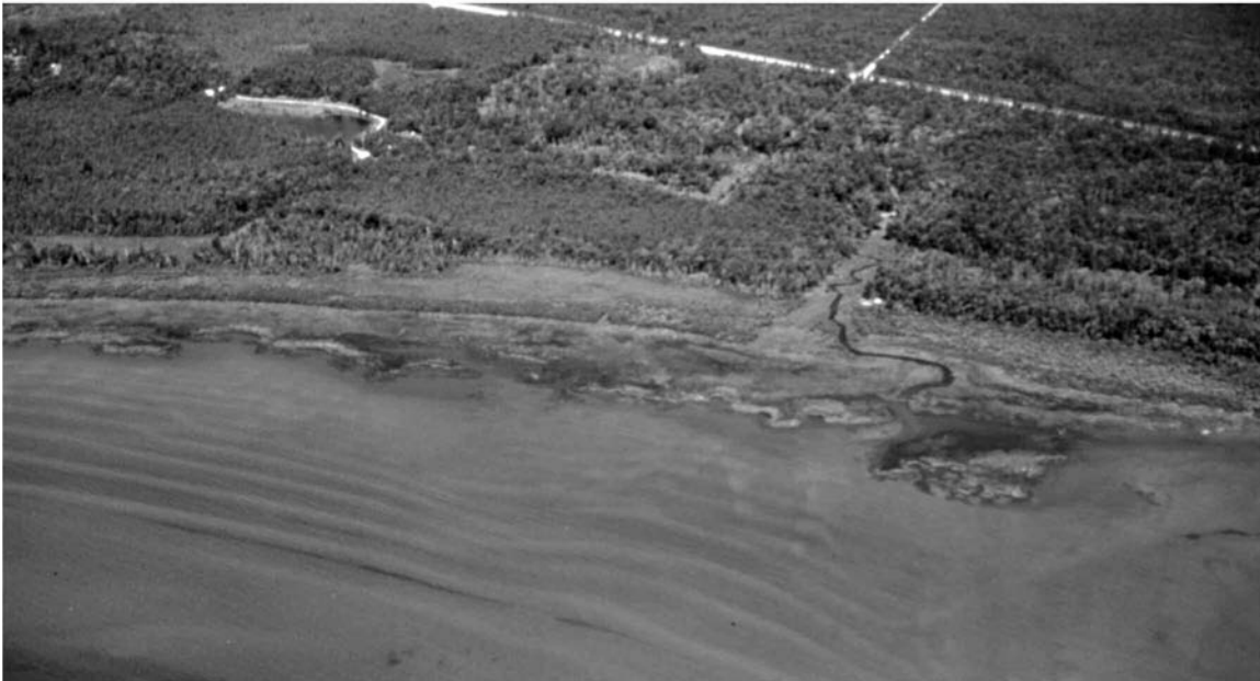
FIG. 2. Lacustrine hydrologic system: Open embayment (LOE-), St. Martin Bay (MI), Lake Huron. Sand bars in the foreground are indicative of a high-energy coastal environment.

embayments also fit into this class due to exposure to prevailing winds; most of these have relatively narrow vegetation zones of 100 meters or less. Examples include Epoufette Bay (MI) on Lake Michigan and shoreline reaches in the Bay of Quinte (ON) on Lake Ontario. In past mapping efforts along the Great Lakes, few open shoreline wetlands were identified by either Herdendorf et al. (1981a–f) or NWI. Many open shorelines do not have large or dense enough areas of aquatic plants to be identified from aerial photography.