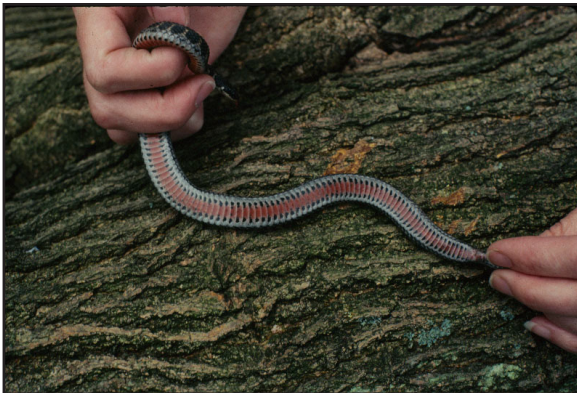
Photo of underside of Kirtland's Snake