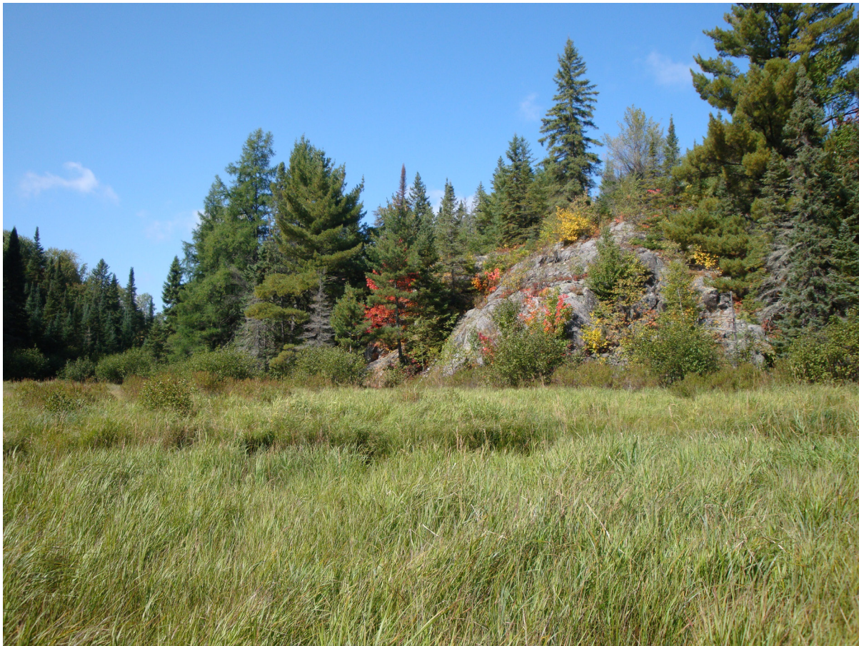
Northern wet meadow adjacent to granite bedrock glade, Marquette County.

Funding for abstract provided by Michigan Department of Military and Veterans Affairs.