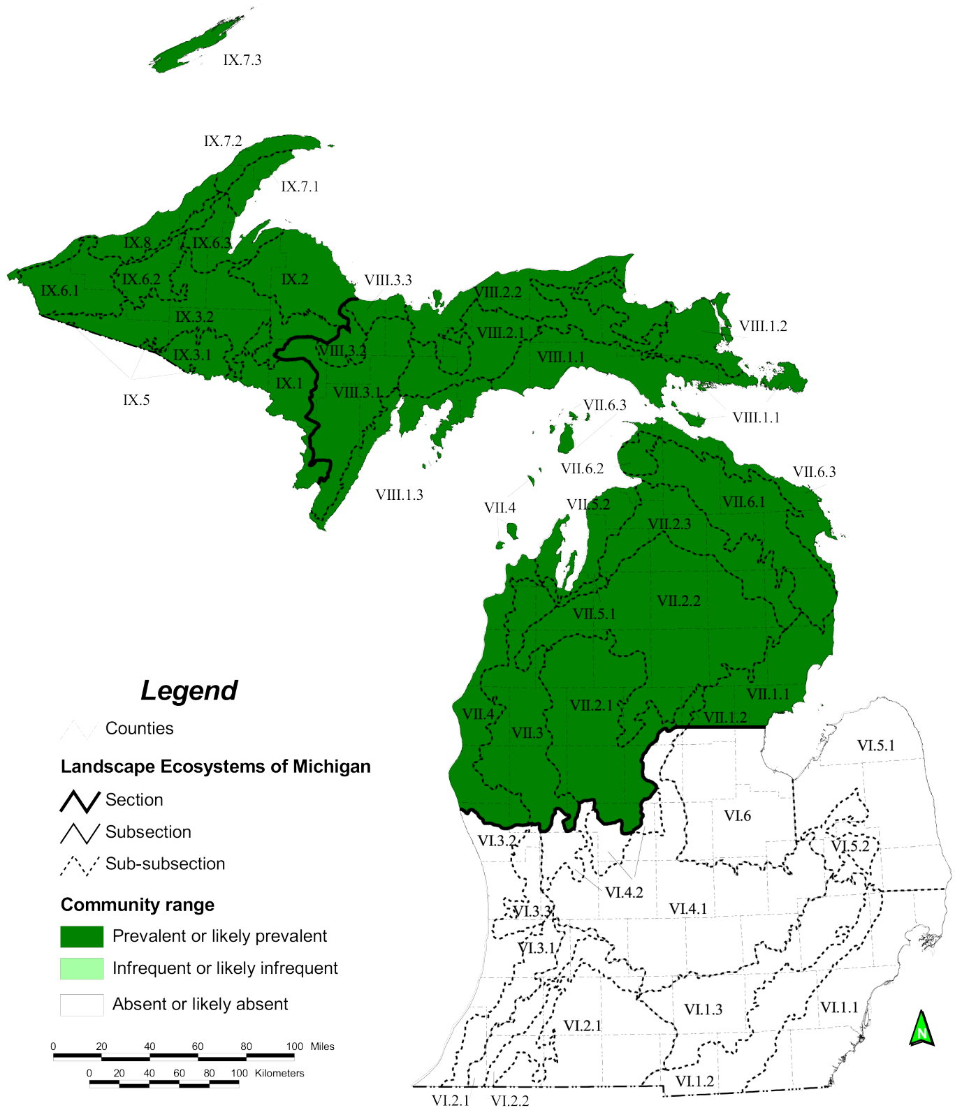
Ecoregional map of Michigan (Albert 1995) depicting distribution of northern wet meadow (Albert et al. 2008)