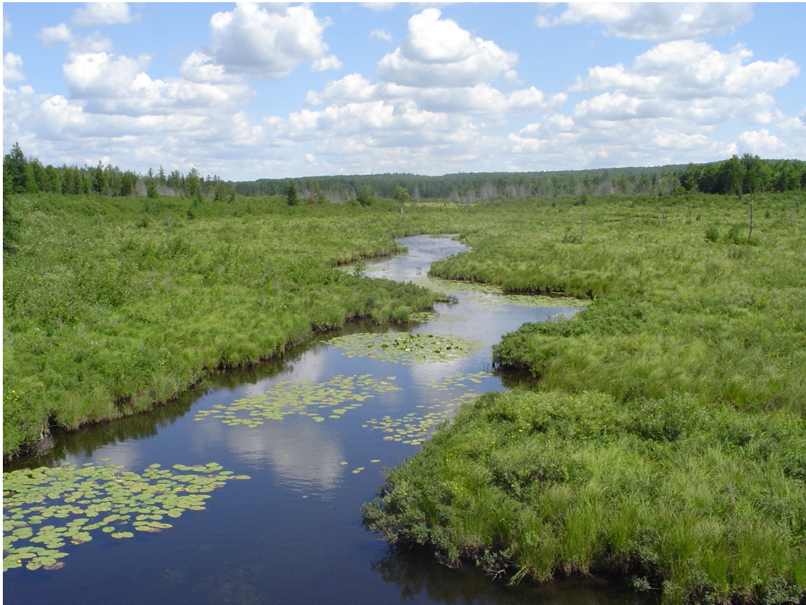
Meandering streams, sedge tussocks, and scattered trees and shrubs are prevalent structural attributes of northern wet meadows that influence floristic and faunal composition.