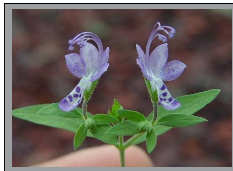
The stamens and style arch over the spotted lower petal, facilitating insect pollination.

Recognition: T. dichotomum is an annual herbaceous plant reaching up to 70 cm in height. The terminal stems and numerous lateral branches are covered in minute, dense, glandular hairs, and bear opposite, oval, entire leaves that give off an aromatic lemon-like fragrance when crushed. The pale blue flowers are borne at the ends of lateral and terminal branches, and have 4 small upper petals and one larger lower petal that is spotted with dark blue. The calyx (leaf-like bracts at the base of the flower) has 5 lobes, the 2 lower lobes much shorter than the 3 upper ones. The style and 4 stamens arch over the ovary and lower petal. Fruits are borne as a cluster of four tiny,