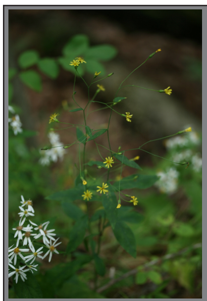
smith @ USDA-PLANTS Database