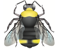
B. fernaldae 5 Fernald's cuckoo bumble bee