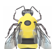
B. rufocinctus Red-belted bumble bee S 2