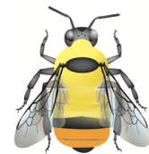
B. frigidus 5 Frigid bumble bee