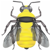
B. borealis Northern amber bumble bee S 3