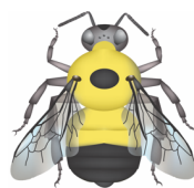
B. vagans Half-black bumble bee A 1