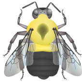
B. impatiens Common eastern bumble bee A 1