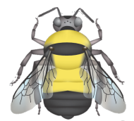
B. fraternus 5 Southern Plains bumble bee