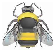
B. terricola Yellow banded bumble bee N 3