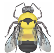
B. affinis (worker) Rusty-patched bumble bee S 4