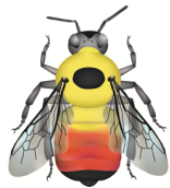
B. rufocinctus Red-belted bumble bee S 2