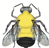
B. perplexus Confusing bumble bee S 2