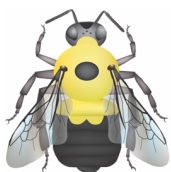
B. bimaculatus Two-spotted bumble bee A 1