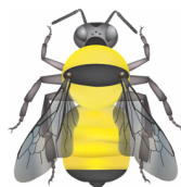
B. fervidus Yellow bumble bee S 2