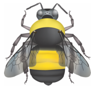
B. pensylvanicus American bumble bee S 3