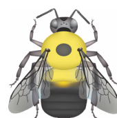
B. griseocollis Brown-belted bumble bee A 1