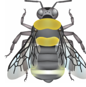
B. ashtoni 5 Gypsy cuckoo bumble bee