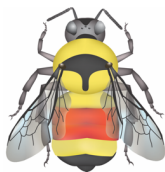
B. ternarius Tri-colored bumble bee N 1