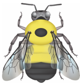
B. affinis (queen) Rusty-patched bumble bee S 4