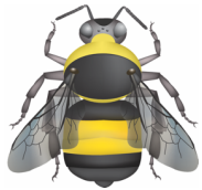
B. auricomus Black-and-gold bumble bee S 3