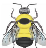
B. sandersoni Sanderson's bumble bee S 2