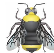
B. insularis 5 Indiscriminate cuckoo bumble bee