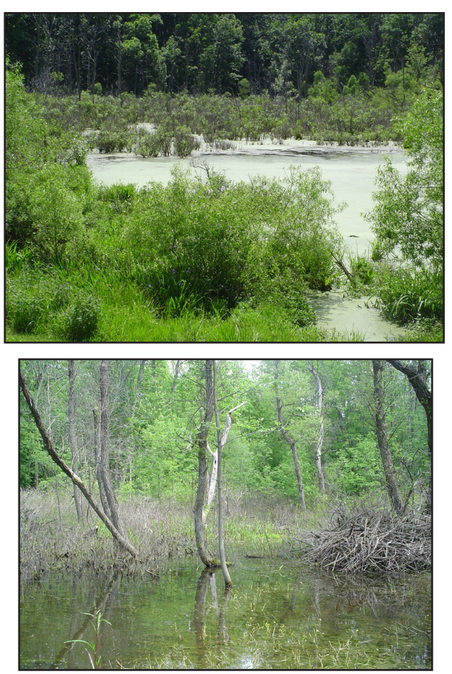
Photos of Copperbelly Water Snake habitat by Michael A. Kost (top) and Kile Kucher (bottom)

The soil at many of the known copperbelly sites in Michigan indicate significant capacity for water retention and presence of high water tables and extended periods of standing water (Kost et al. 2006). Kost et al. (2006) found silt- or clay-dominated soil horizons in at least some portion of all the natural communities evaluated at most of the known copperbelly sites in Michigan. All sites evaluated contained gleyed soil horizons, which form when mineral soil (e.g., sand, silt, and clay) is saturated for much of the year (Kost et al. 2006). Iron mottling, which is indicative of high water tables and fluctuating water levels, also was found at a number of sites (Kost et al. 2006).