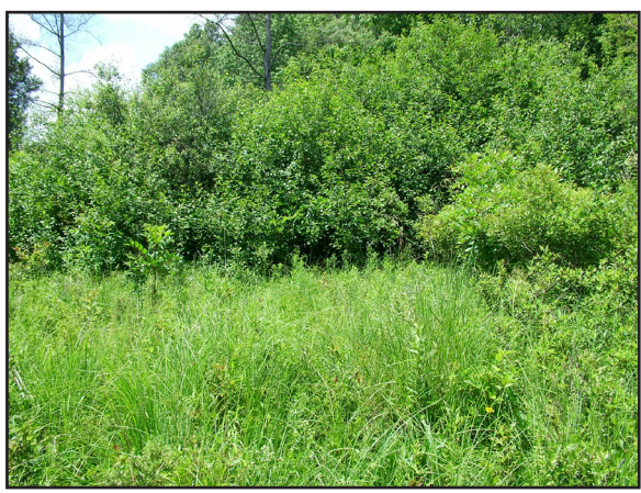
Photo of glossy buckthorn invading a fen in Jackson County

species such as glossy buckthorn ( Frangula alnus [ Rhamnus frangula ]), purple loosestrife ( Lythrum salicaria ), common buckthorn ( Rhamnus cathartica ), and the common reed ( Phragmites australis ) (USFWS 1998, Kost and Hyde 2009, Hoving 2010). In addition, added nutrients from leaking septic tanks, drainfields, agricultural runoff, lawn fertilizer and salt spray provide a competitive advantage to aggressive invasive plants and threaten the plants and animals that have evolved to thrive in a highly alkaline, low nutrient environment (Kost and Hyde 2009, Hoving 2010).