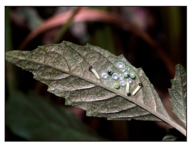
Photo of Mitchell's satyr eggs and 1st instar larvae