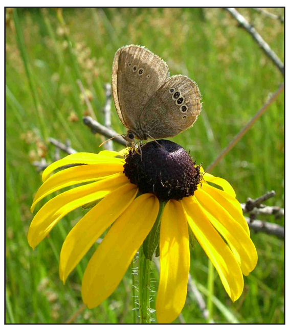
Mitchell's satyr occasionally nectar on flowers although it is rarely seen.