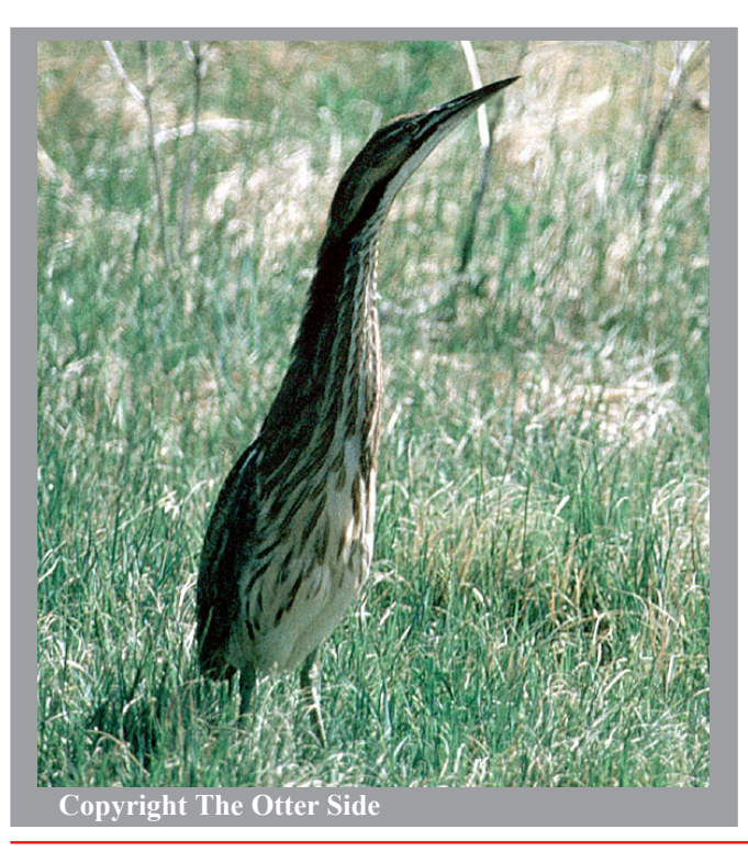
Status: State special concern