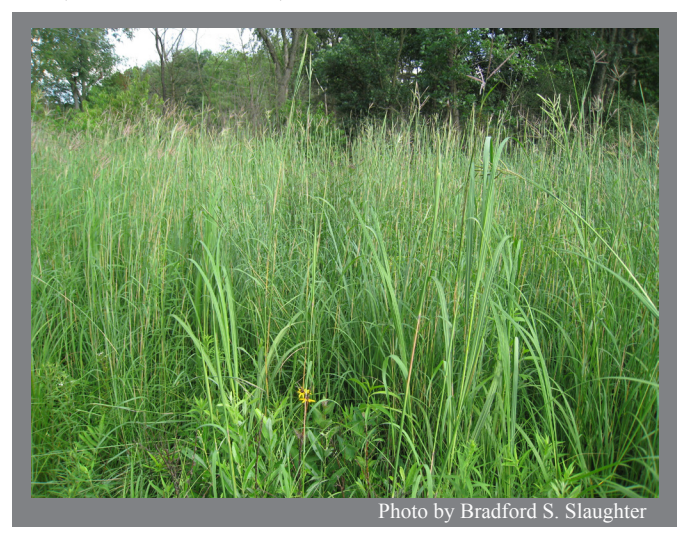
Big bluestem ( Andropogon gerardii ) and cordgrass ( Spartina pectinata ) dominate a small wet-mesic prairie in Barry County.

Shrubs that occasionally occur within wet-mesic prairie include shrubby cinquefoil ( Potentilla fruticosa ), which is an occasional dominant, silky dogwood ( Cornus amomum ), gray dogwood ( C. foemina ), red-osier dogwood ( C. stolonifera ), ninebark ( Physocarpus opulifolius ), Bebb's willow ( Salix bebbiana ), pussy willow ( S. discolor ), sandbar willow ( S. exigua ), prairie willow ( S. humilis ), and meadowsweet ( Spiraea alba ). Scattered tree species may include red maple ( Acer rubrum ), tamarack ( Larix laricina ), black cherry ( Prunus serotina ), and quaking aspen ( Populus tremuloides ). Woody species increase in the absence of fire (NatureServe 2009).