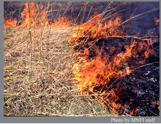
Prescribed fire is a critical component of wet-mesic prairie management and restoration. Burns implemented every one to three years restrict encroachment of woody species and create conditions suitable for the maintenance of plant species diversity.

Managing wet-mesic prairie requires frequent burning. Burn intervals longer than one to three years will result in tree and tall shrub encroachment. Prescribed burning is required to protect and enhance plant species diversity and prevent encroachment of trees and tall shrubs, which, in the absence of fire, outcompete lightdependent grasses and forbs. Long-term fire suppression is associated with local extinctions of plant species in otherwise intact prairie remnants (Leach and Givnish 1996). In addition to prescribed fire, brush cutting accompanied by stump application of herbicide is an important component of prairie restoration. While fires frequently kill woody seedlings, long-established trees and tall shrubs such as black cherry (Prunus serotina) and dogwoods (Cornus spp.) typically resprout and can reach former levels of dominance within two to three years. Herbicide application to cut stumps will prevent resprouting.