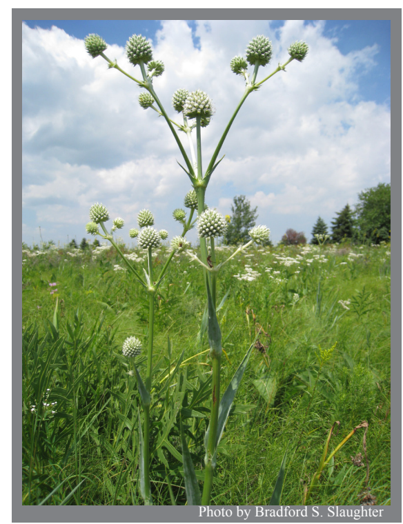
Rattlesnake-master ( Eryngium yuccifolium ) is a state-threatened forb associated with wet-mesic prairie and other prairie communities. The distinctive, glaucous basal leaves, with their thread-like marginal teeth, are unmistakable.