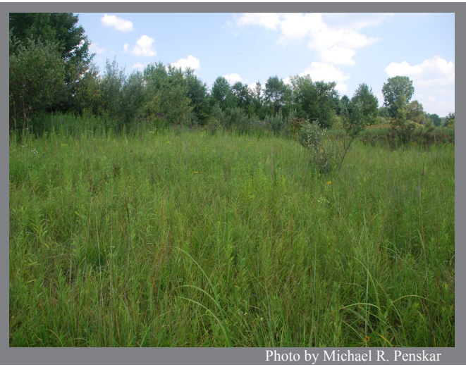
Wet-mesic prairie often occurs as narrow ecotonal bands at the margins of prairie fen, where the community is subject to encroachment by invasive plant species, including autumn olive ( Elaeagnus umbellata , background).

Invasive plant species are a significant threat to wetmesic prairie. In addition to reed canary grass, species of particular concern include narrow-leaved cat-tail (Typha angustifolia), hybrid cat-tail (T. xglauca), common reed (Phragmites australis), Kentucky bluegrass (Poa pratensis), redtop (Agrostis gigantea), purple loosestrife (Lythrum salicaria), glossy buckthorn (Rhamnus frangula), common buckthorn (R. cathartica), multiflora rose (Rosa multiflora), and autumn olive (Elaeagnus umbellata). Fragmentation and isolation of wet-mesic prairie occurrences by residential, commercial, and industrial development threatens this natural community type by restricting dispersal of native species and increasing the spread of commonly planted non-native herbs, shrubs, and trees. Monitoring and removal of invasive species should focus on those species that threaten to alter community composition, structure, and function. Management activities should avoid soil and hydrologic disturbances that favor the spread of invasive plant species.