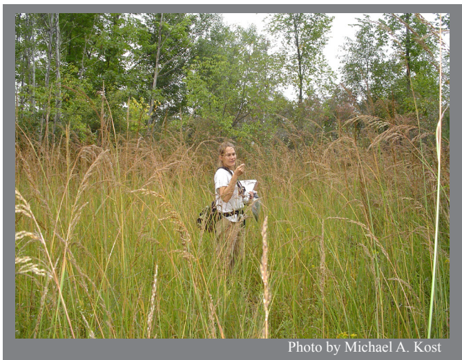
Indian grass ( Sorghastrum nutans ), one of the characteristic grasses of wet-mesic prairie, often forms dense stands on the sandy margins of prairie fens.

forest. In southwestern Lower Michigan, where upland prairies were common, wet-mesic prairie occasionally graded into adjacent upland prairie types such as mesic prairie, mesic sand prairie, and dry-mesic prairie. A variety of open or forested wetland communities occur in adjacent lowlands, including southern wet meadow, prairie fen, wet prairie, southern shrub-carr, rich tamarack swamp, and southern hardwood swamp. Historically, wet-mesic prairie on glacial lakeplain was associated with extensive tracts of emergent marsh, lakeplain wet prairie, lakeplain oak openings, and wetmesic flatwoods (Comer et al. 1995, Albert and Kost 1998a, 1998b, Kost et al. 2007). The concentration of wet-mesic prairie in a savanna landscape, instead of a prairie landscape, may account for differences in soils and plant species composition between wet-mesic prairies in southern Michigan, where savanna was historically dominant, and those in the "prairie states" to the west (see Vegetation section below).