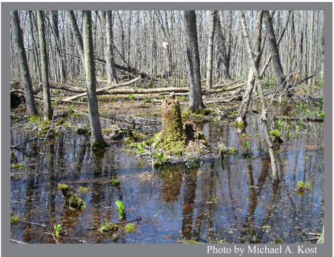
Inundated soil conditions follow snow melt and rain in early spring (above). Water levels recede during summer, when remaining surface water is obscured by vegetation (below).

Surface water slope wetlands are similar to surface water depression wetlands, but occur on a slope that allows outflow of precipitation and runoff. These systems usually occur adjacent to lakes, streams, and other water bodies. Seasonal fluctuation of the water level in these water bodies causes periods of inundation in the adjacent wetland, which is otherwise perched above the water table (Novitzki 1979, Brinson 1993). Southern hardwood swamps that develop on surface water slopes (e.g., along a lakeshore) are characterized by species similar to those found in floodplain forests and in surface water depressions on glacial lakeplain (Knopp 1999, Barnes and Wagner 2004, Tepley et al. 2004, Lee 2005).