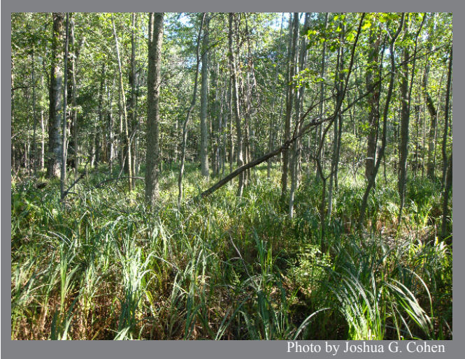
Reduction of the water table and a lack of fire can facilitate the conversion of open, graminoid-dominated wetlands to southern hardwood swamp.

for the community. This species has the potential to significantly alter the community by eliminating two of the dominant canopy tree species, green ash and black ash, from the system. Loss of trees may result in higher water tables and conversion of some stands to shrub-dominated wetlands, exacerbating a long-term trend of conversion of forested wetland to non-forested wetland (Comer 1996). Emerald ash borer has the potential to reduce acreage of high quality southern hardwood swamp and increase its rarity within the state and throughout the eastern United States and adjacent Canadian provinces.