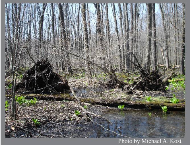
Shallowly rooted trees growing on structurally weak organic soils are susceptible to windthrow, which creates canopy gaps and the characteristic pit-and-mound topography of the soil surface.

small-scale gradients in soil moisture and chemistry, providing suitable microhabitats for a diversity of plant species (Christensen et al. 1959, Paratley and Fahey 1986, Vivian-Smith 1997, McGee 2001, Anderson and Leopold 2002). In addition, the canopy gaps created by small-scale windthrow allow light to penetrate to the forest floor, creating conditions suitable for lightdependent tree seedlings and saplings, shrubs, and herbs.