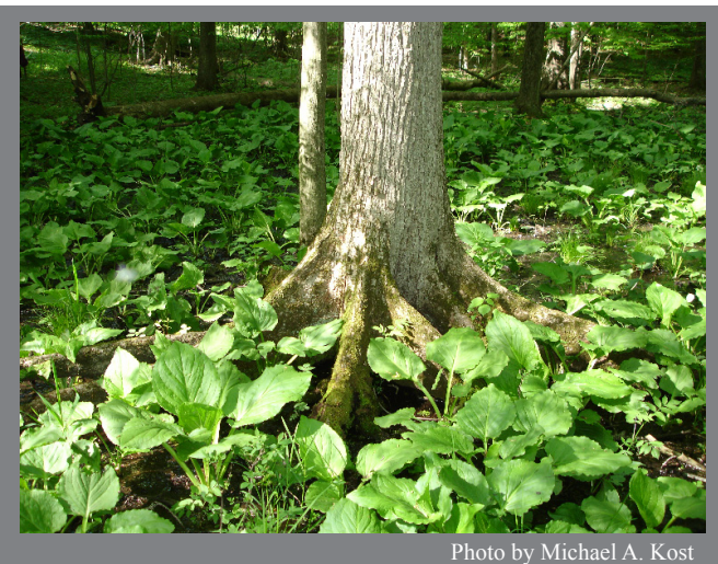
The shallow, buttressed roots of wetland trees and a dense ground layer of skunk-cabbage ( Symplocarpus foetidus ) are characteristic of southern hardwood swamp on organic soils.

chokeberry (Aronia prunifolia), musclewood (Carpinus caroliniana), gray dogwood (Cornus foemina), hazelnut (Corvlus americana), Michigan holly (Ilex verticillata), spicebush (Lindera benzoin), choke cherry (Prunus virginiana), swamp rose (Rosa palustris), elderberry (Sambucus canadensis), poison sumac (Toxicodendron vernix), highbush blueberry (Vaccinium corymbosum), nannyberry (Viburnum lentago), and prickly ash (Zanthoxylum americanum). Black chokeberry, swamp rose, poison sumac, and highbush blueberry are concentrated in groundwater-influenced sites. Buttonbush (Cephalanthus occidentalis) occurs in vernal pools, inundated shrub swamps, or wet openings within the forest. Frequently encountered low shrubs include running strawberry bush (Euonymus obovata), wild black currant (Ribes americanum), prickly gooseberry (R. cynosbati), common blackberry (Rubus allegheniensis), and wild red raspberry (R. strigosus).