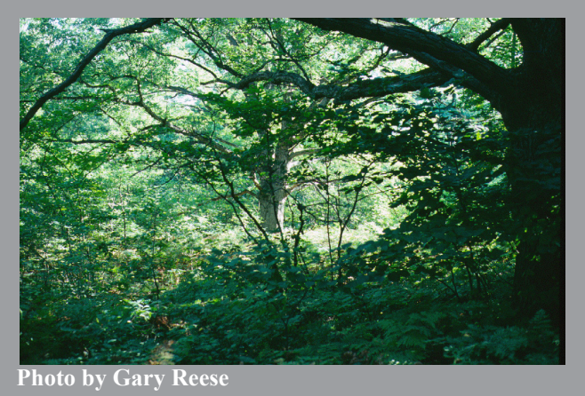
Canopy closure and woody encroachment in a fire suppressed

1995, Faber-Langendoen and Davis 1995, Peterson and Reich 2001). Canopy oaks within these barrens rarely burn because of low fuel loads beneath their crowns, which shade out light-demanding vegetation (Anderson and Brown 1983). Frequent low-intensity fires also maintain high levels of grass and forb diversity by deterring the encroachment of woody vegetation and limiting single species dominance. Absence of fire in oak barrens causes increased litter layer and fuel loads, decreased herb layer diversity, increased canopy and subcanopy cover, invasion of fire-intolerant species, and ultimately the formation of a closed-canopy oak community, often within 20-40 years (Curtis 1959, Chapman et al. 1995, Faber-Langendoen and Davis 1995).