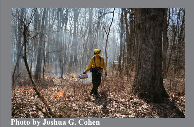
Prescribed fire in remnant oak barrens maintains open canopy conditions, promotes high levels of grass and forb diversity and deters the encroachment of woody vegetation and non-native species.

suppression or destroyed by development, agricultural clearing, sand mining, and extensive timber harvest, there is much opportunity for restoration of this community type. Plant species of oak barrens can persist through cycles of canopy closure and removal (Chapman et al. 1995). The occurrence of oak barrens indicator species in closed-canopy forests reveals the presence of a native seedbank and highlights that area as a target for restorative management. Also indicative of a site's potential for restoration is the prevalence of oak "wolf trees." "Wolf trees" are large open-grown trees with wide-spreading limbs that are often associated with oak barrens' plants or seedbank (Michigan Natural Features Inventory 1995).