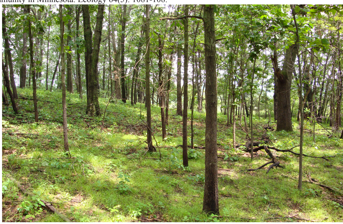
Recently burned oak barrens remnant, Fort Custer, Calhoun County.

Funding for abstract provided by Michigan Department of Natural Resources- Forest Management Division and Wildlife Division.