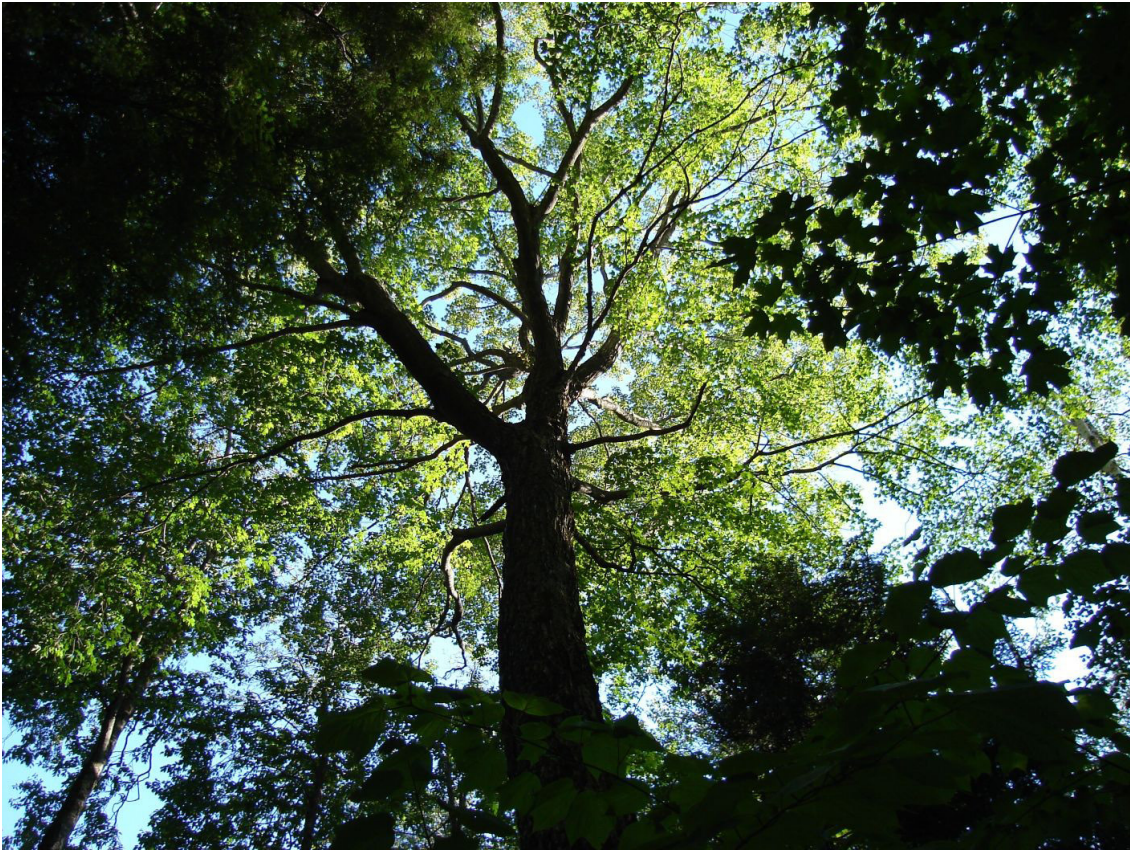
The dense, shade-tolerant canopy of mesic northern forest is periodically and patchily opened by small-scale windthrow events that generate canopy gaps critical for tree regeneration.