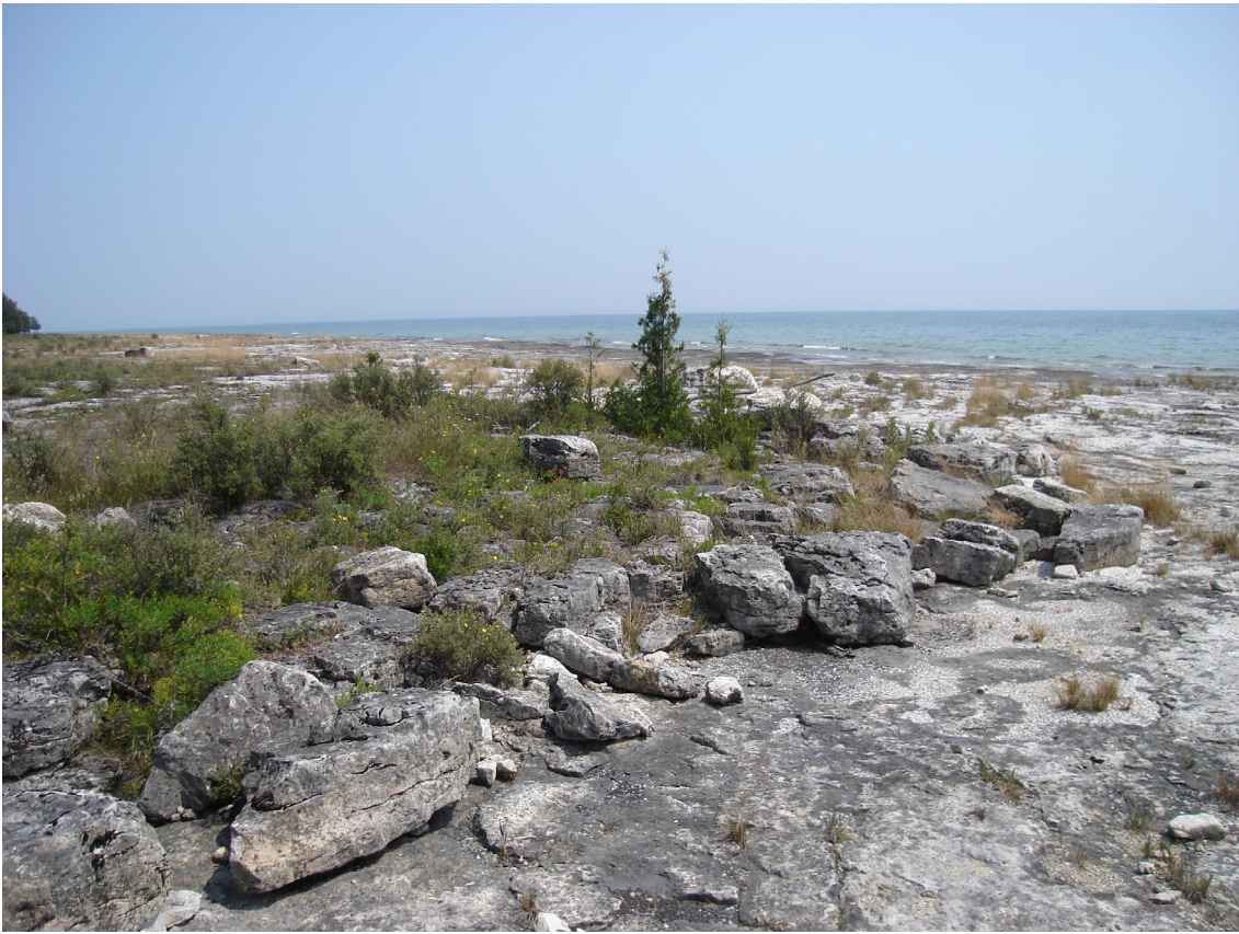
Limestone bedrock lakeshore occurs along the shorelines of northern Lake Michigan and Lake Huron on broad, flat, horizontally bedded expanses of limestone or dolomite bedrock that support sparse vegetation concentrated in cracks and depressions in the bedrock.