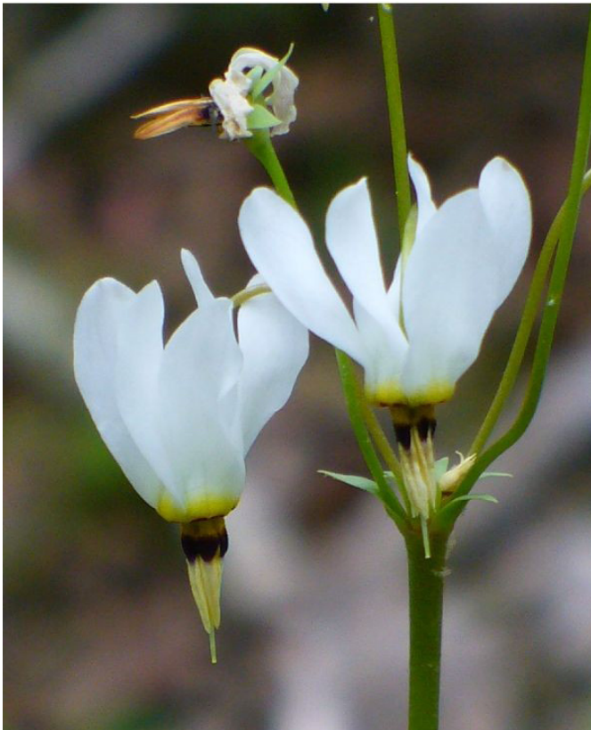
Jeff McMillian @ USDA-NRCS PLANTS Database

60 cm in height. The flowering stems are terminated by umbels of several nodding pink flowers that have strongly reflexed petals and a cone of yellow, forward-projecting stamens, beyond which is the tip of the projecting style (see photos). The fruiting capsule is a dark reddish-brown. This forb is a highly distinctive species which, when in flower, is not readily confused with any other member of our native flora. As noted by Voss (1996), the flowers of cranberry are very similar, but differ in a number of significant respects, not the least of which is their fewer petals (4 versus 5 in shooting star), much smaller size, and trailing habit.