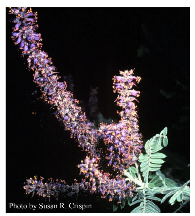
Close-up of inflorescence

fruticosa , a non-native species known in several southern Michigan counties, has a similar inflorescence but is a much more robust, branching shrub ranging up to ca. 4 m in height, and can be easily distinguished by its woody habit, the mostly smooth leaflets that are conspicuously gland-dotted beneath, and flowers that have a smooth calyx and a conspicuously glandular, smooth fruit.